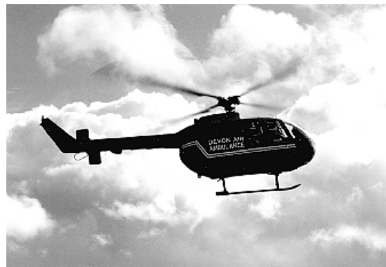
The Devon Air Ambulance